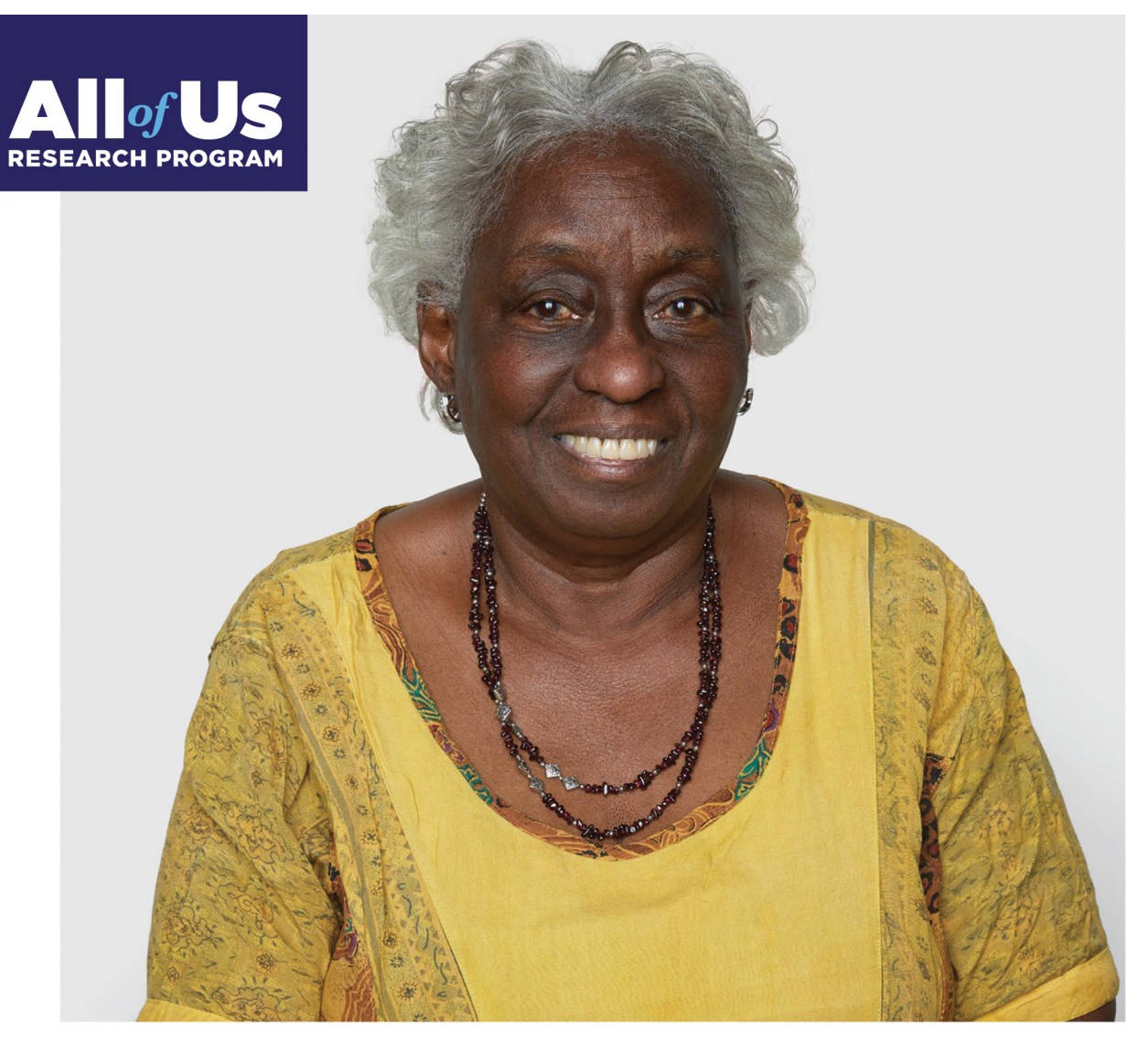
The future of health begins with you

The more researchers know about what makes us unique, the more tailored our health care can become. Join a research effort with one million or more people nationwide to create a healthier future for all of us.